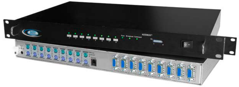
KEEMUX-P8-R (Front & Back)

The KEEMUX® PS/2 KVM switch allows one keyboard, monitor and mouse to control multiple PCs (up to 128 computers). Dedicated internal microprocessors emulate keyboard and mouse presence to each attached PC 100% of the time so all computers boot error free.